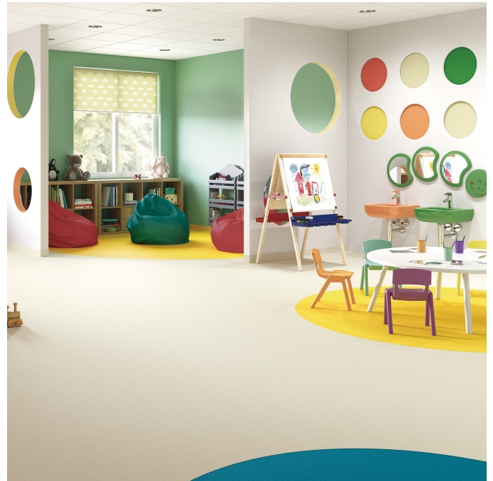
Example of a use area - Polyflor Polysafe Verona PUR PURE

Performance data of the product in accordance with the declaration of performance with respect to its essential characteristics according to EN 14041:2018 Resilient, textile, laminate and modular multilayer floor coverings; Essential characteristics.