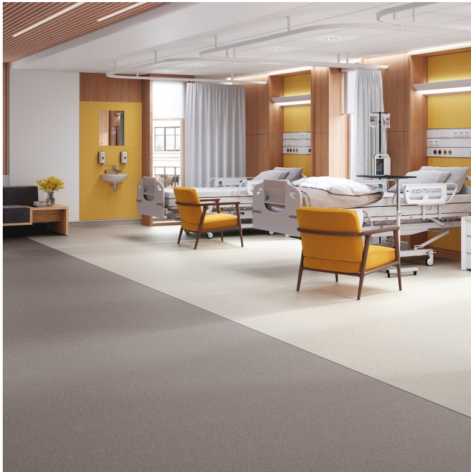
Example of a use area - Polyflor Polysafe Verona PUR Original

Polyflor Polysafe Verona PUR (Original and PURE Colours) are use classified at 23, 34, 43 according to ISO 10874.